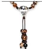
NHS1500-94 (Brown Striped Agate)