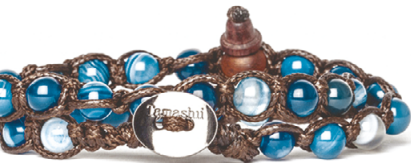
Double loop Tamashii bracelet