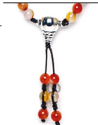
NHS1500-118 (Red Striped Agate)