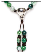
NHS1500-140 (Green Striped Agate)