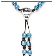
NHS1500-07 / NHS1600-07 (Turquoise)