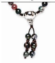
NHS1500-17 / NHS1600-17 (Moss Agate)