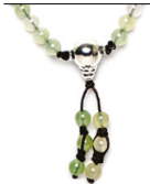
NHS1500-63 (Apple Green Agate)