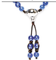
NHS1500-18 / NHS1600-18 (Blue Agate)