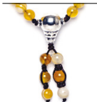
NHS1500-155 (Yellow Striped A.)