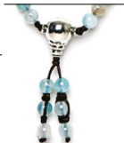
NHS1500-165 (Sky Blue Striped Agate)