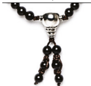
NHS1500-01 / NHS1600-01 (Onyx)